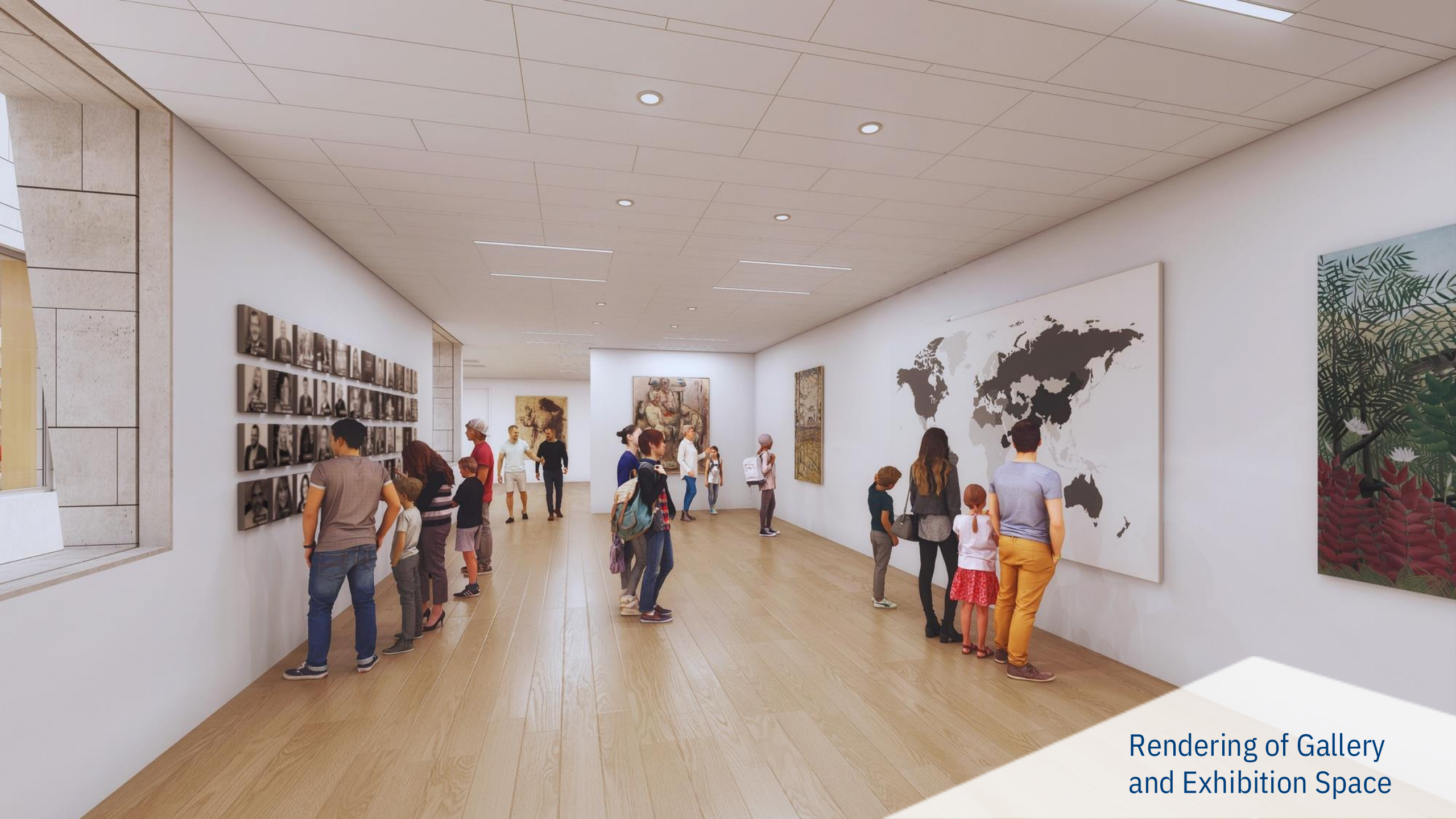
Rendering of Gallery and Exhibition Space