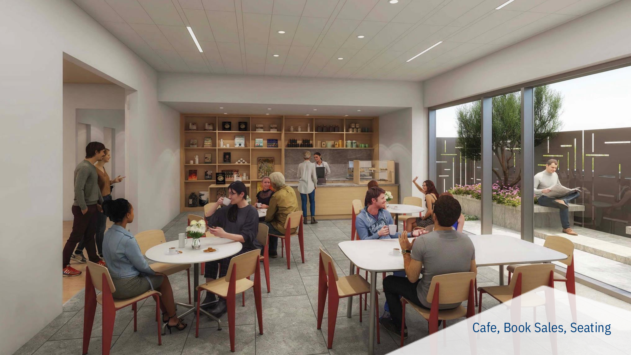
Cafe, Book Sales, Seating