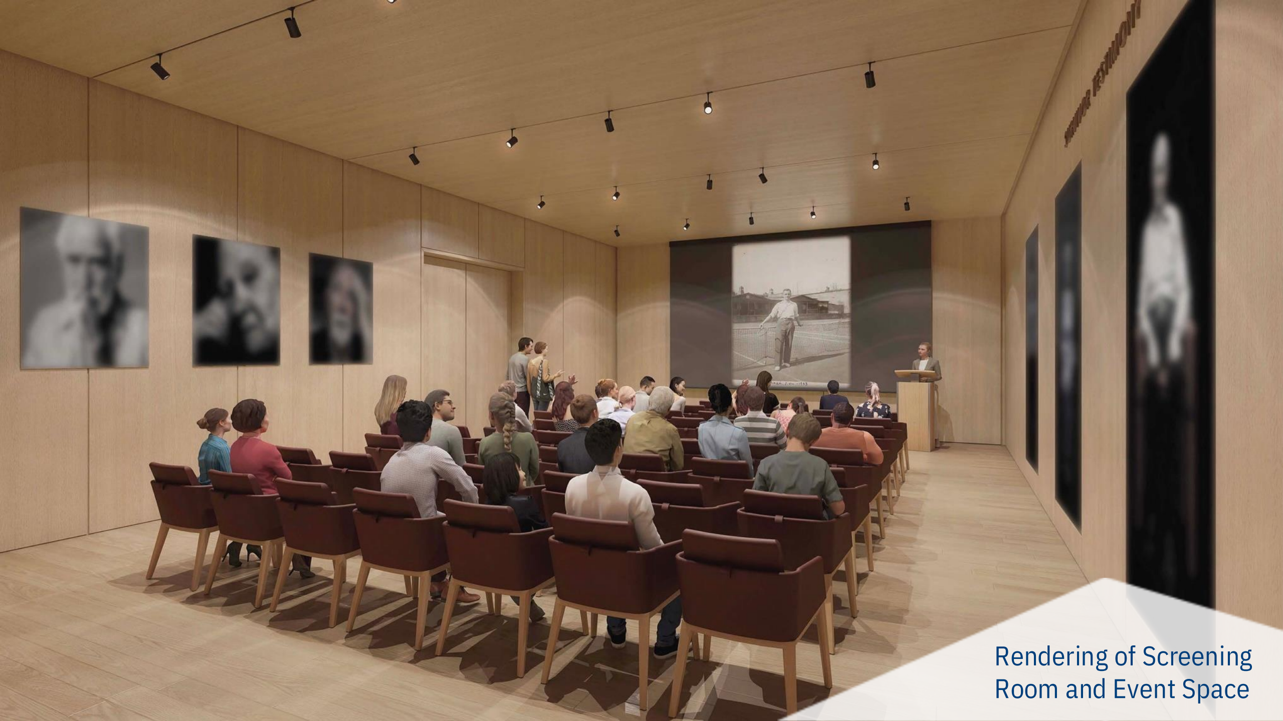
Rendering of Screening Room and Event Space