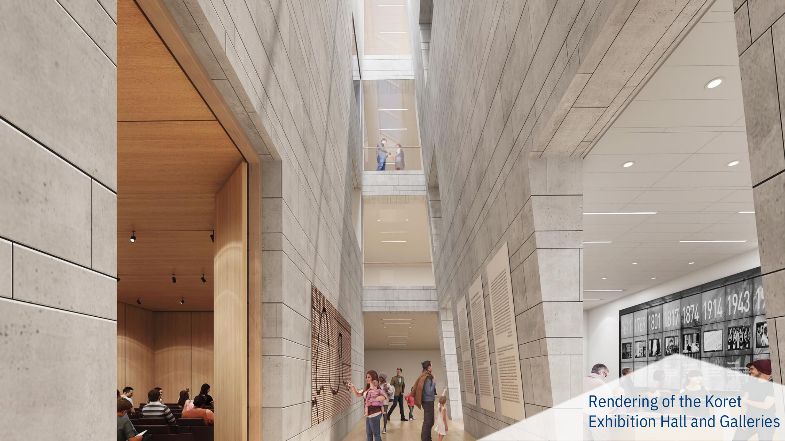
Rendering of the Koret Exhibition Hall and Galleries