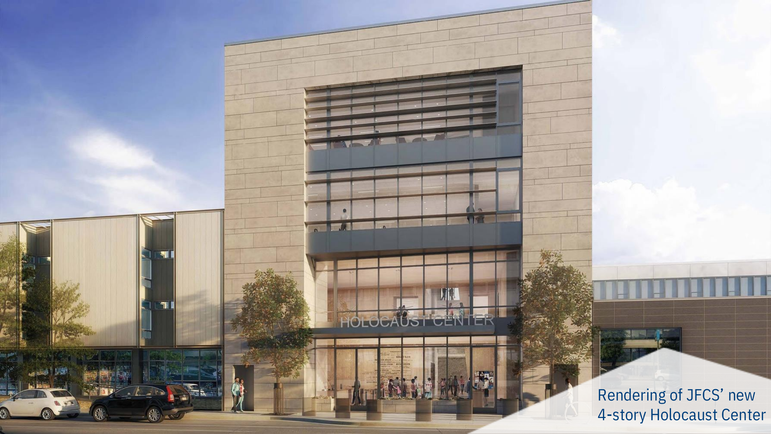
Rendering of JFCS' new 4-story Holocaust Center