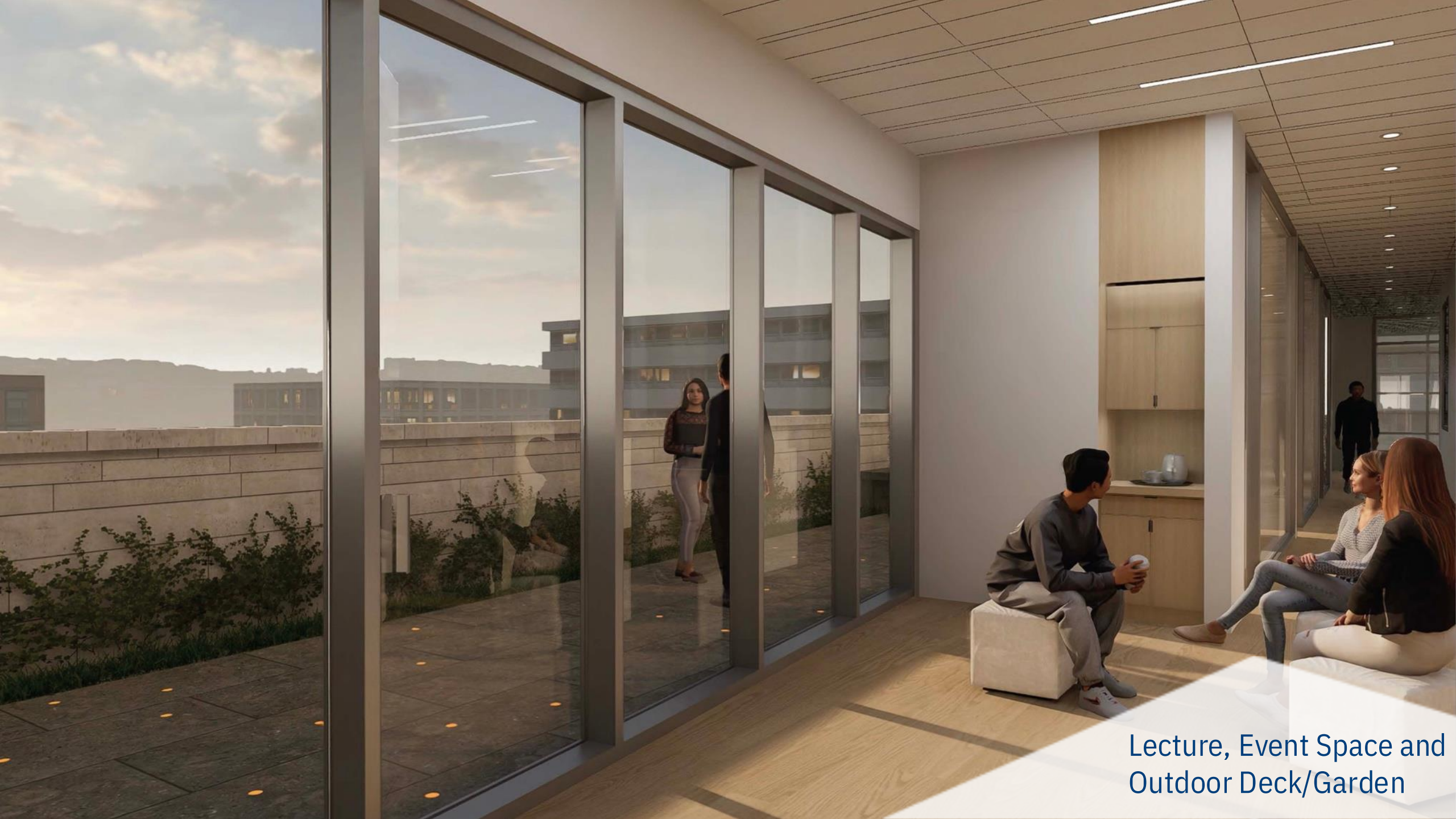
Lecture, Event Space and Outdoor Deck/Garden