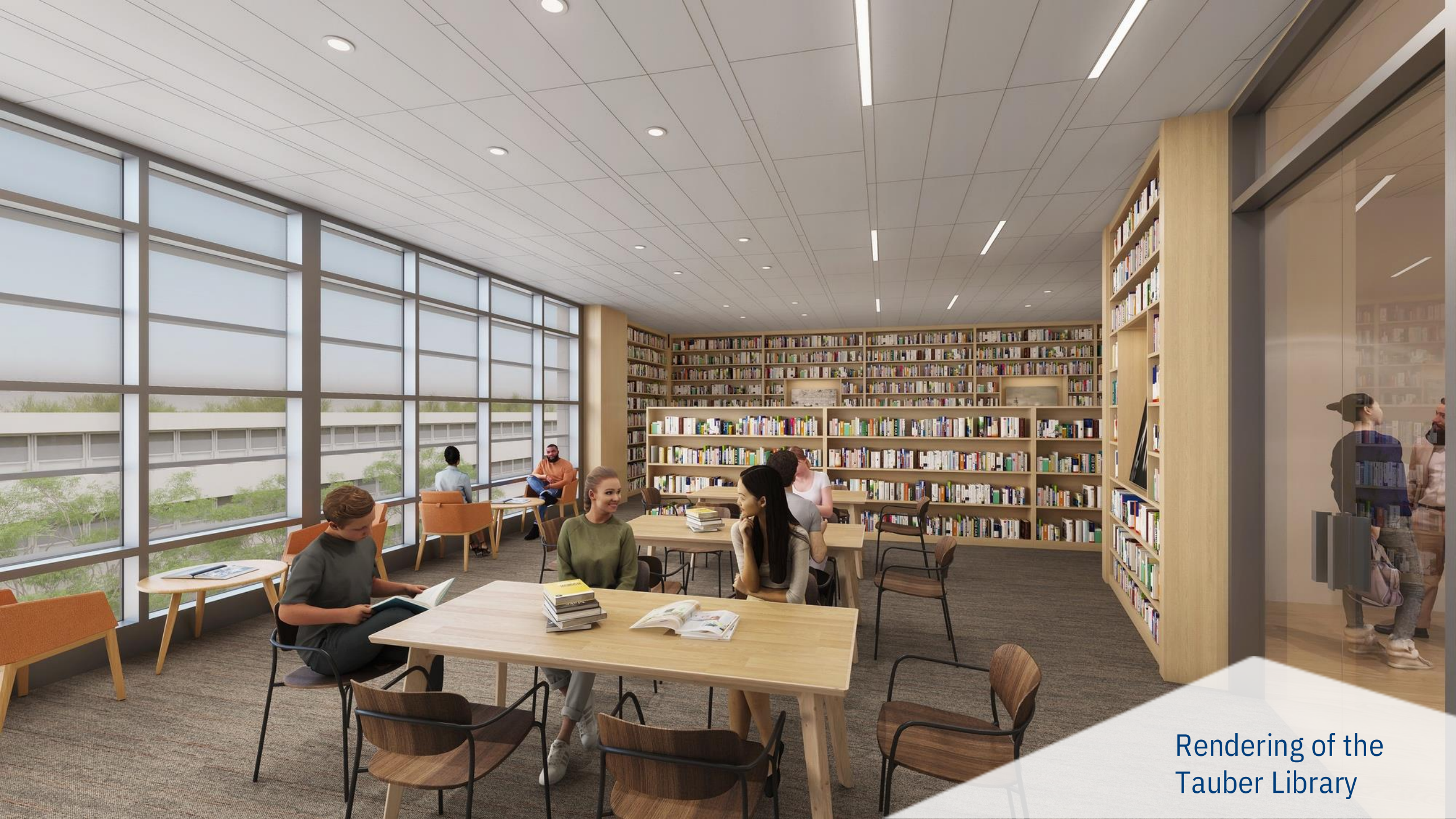
Rendering of the Tauber Library