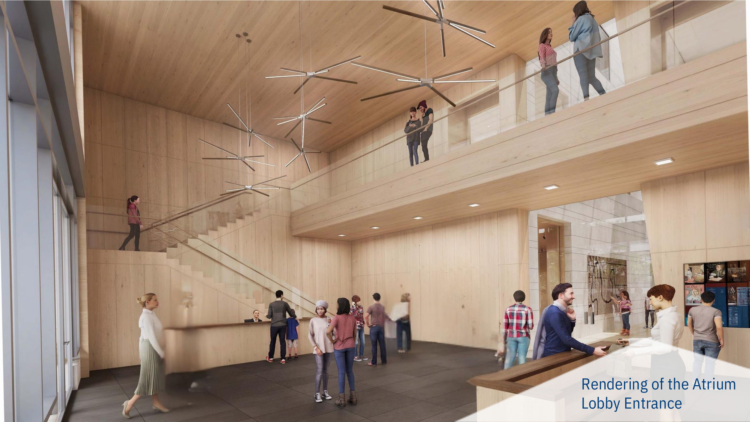
Rendering of the Atrium Lobby Entrance